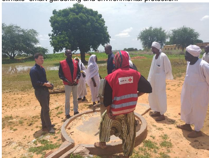
Image 1: SRCS, SRC and the Teacher Parent Association (TPA) visiting AlBirka Madina Boys School waterpoint

Likewise, within a collaboration framework with stakeholders such as the Ministry of Health, Ministry of Education and that of Environment and Water Resources, as well as the local authorities, the project is increasing the knowledge and disseminating good practices that are translated into improved policies. The project is essentially focussing on the community health and geared towards prevention. Therefore, it helps to play the interface between the vulnerable population that are at the centre of our action and the public authority. Thus, giving them the opportunity to have access to quality public services and at the same time contribute to the behaviour change for a healthy life. The project encourages innovation that comes with the creativity from school children especially within the school clubs which spearhead the project in schools. These school clubs enable students to demonstrate their hidden talents through drama, painting, art and the like to promote good hygiene practices, climate- smart gardening and environmental protection.