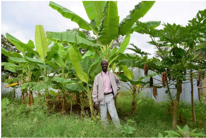
Image 1: Member of the school's parent committee in front of the school garden.

The objective of the project is to improve livelihoods by investing in the next generation, because children are key change agents in their communities. In total, the project focuses on ten schools. Works on infrastructure improvement and capacity building activities are undertaken in a complementary manner. The applied and proven Blue Schools approach enables learning through hands-on practice and allows further dissemination of knowledge by the students to the communities. Additionally, the innovative "Goats for Girls" (G4G) approach is implemented to focus on a higher and persisting girl's school attendance rate through economical support and livestock training.