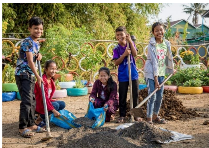
Image 1: In the school gardens, pupils learn how the production of food is closely related to the efficient use of natural resources. In a playful way, they improve their knowledge about healthy nutrition, sustainable farming methods and land and water use.