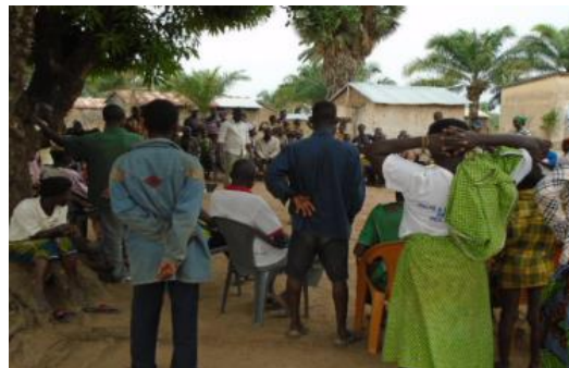
An awareness-raising session about good WASH practice