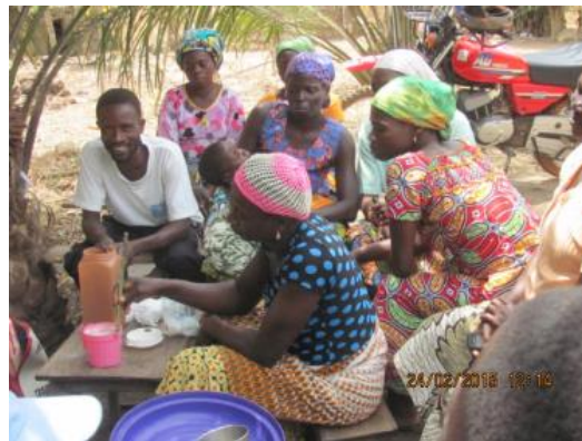
A mothers' club producing chlorine with support from WATA.