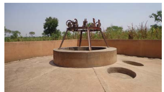
PHNS-style pastoralist well

To overcome the fact that the media have not really participated in achieving the Sustainable Development Goals (SDGs); HEKS and Swissaid helped to organise an International Media Symposium for Sustainable Development by 2030 (SIMED). They had a joint stand there to raise awareness about the SDC's Water Consortium project. Participants at the SIMED promised to inform and raise awareness so that the SDGs might be achieved.