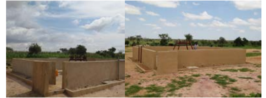
PHNS type wells